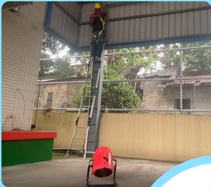
Work at height

Available for various places that need air circulation