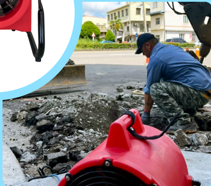
Outdoor construction area