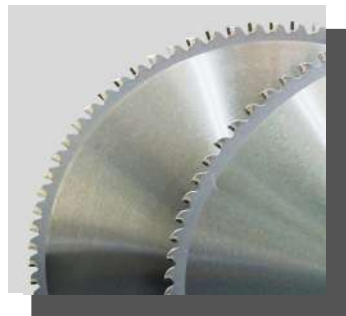
Japanese made saw blades