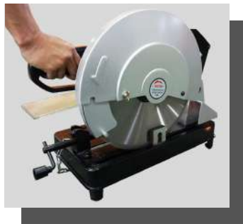
No heat and little spark