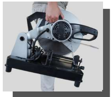
Easy to carry